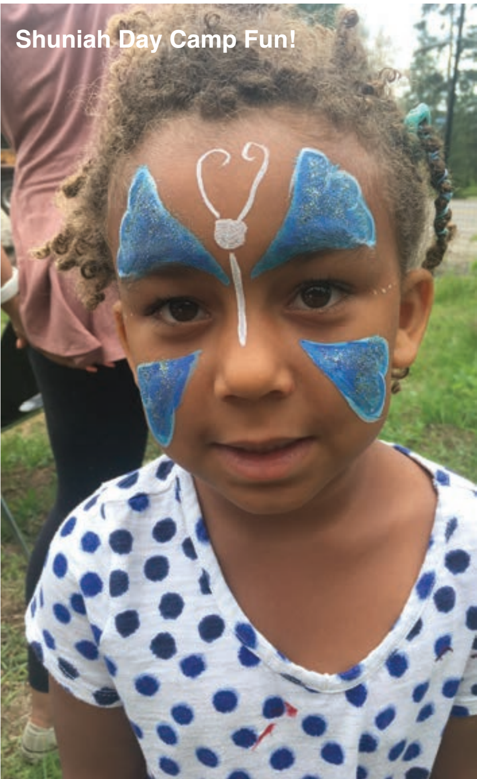
Shuniah Day Camp Fun!