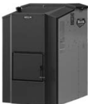
Maxim M255 PE Outdoor Wood Pellet and Corn Furnace