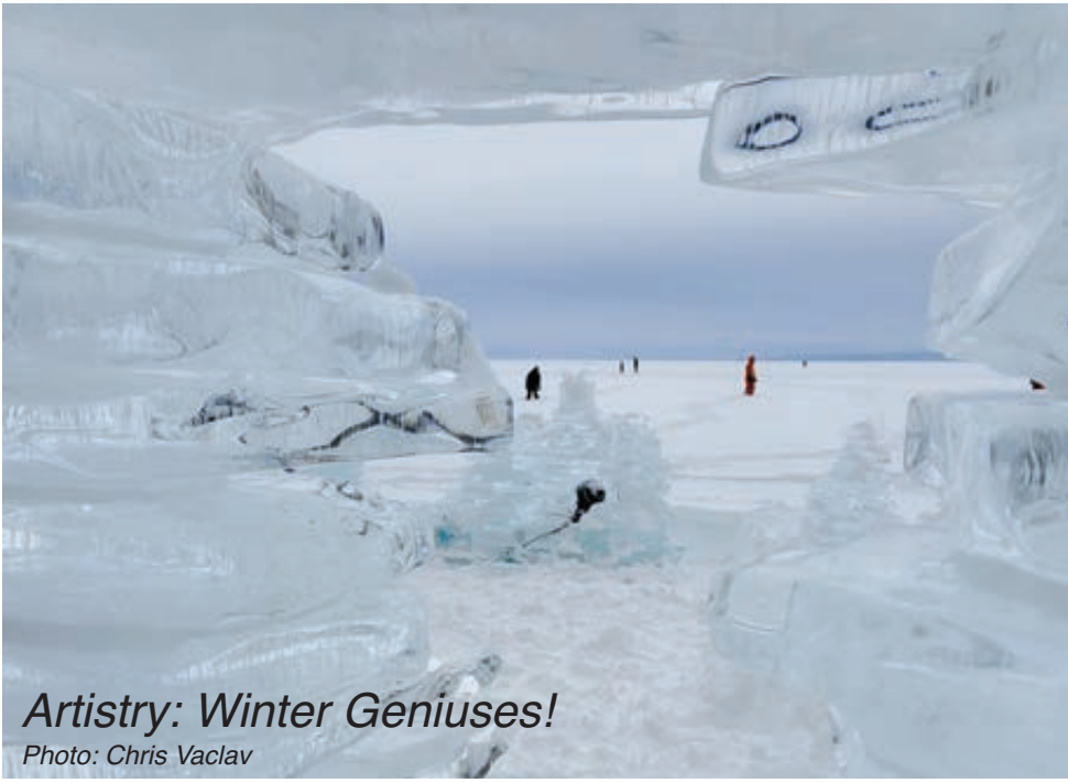
Artistry: Winter Geniuses!