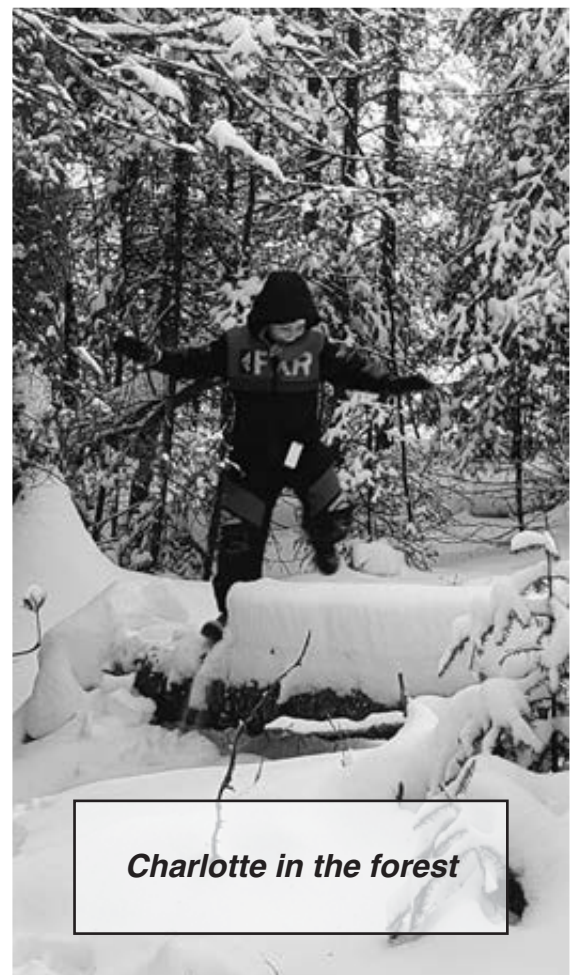
Charlotte in the forest