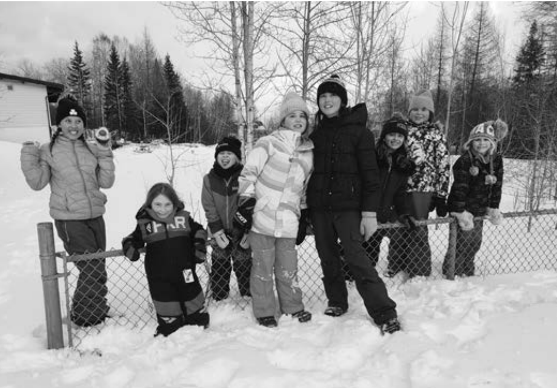
The Guides while filming their music video

Follow us at MacGregor Rec Centre to find out what nightly activities will be offered. Our staff is excited to be together in person again.... And so are the kids! Wednesdays are DIY night - learn to build or bake or create something new! Fridays are Games night - Join us for a game of Capture the Flag, soccer, road hockey - outside whenever possible.