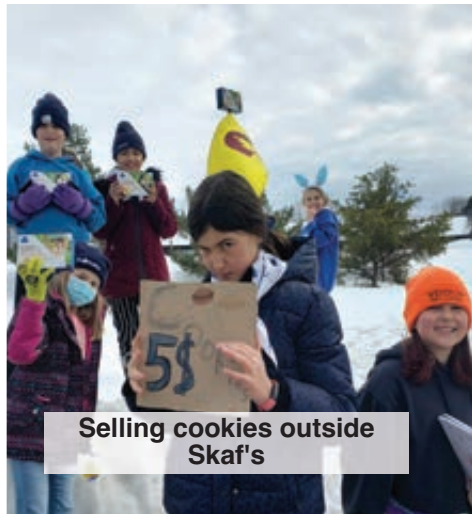
Selling cookies outside Skaf's