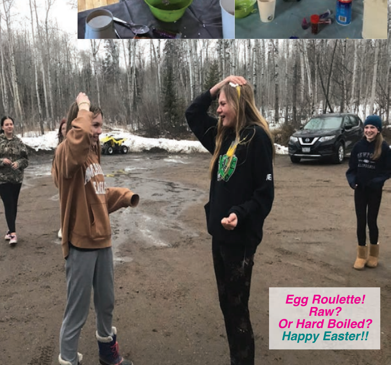
Egg Roulette! Raw? Or Hard Boiled? Happy Easter!!