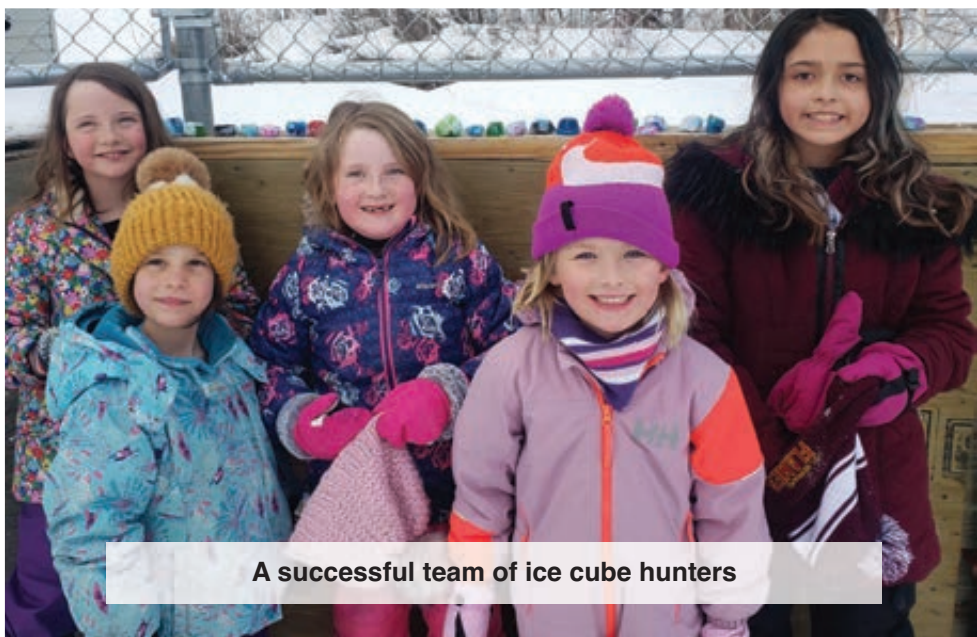
A successful team of ice cube hunters

We started meeting in person just after March Break. Our first activity was tubing at Mount Baldy. With pizza, drinks and cupcakes the girls loved the celebration of our return to in-person activities.