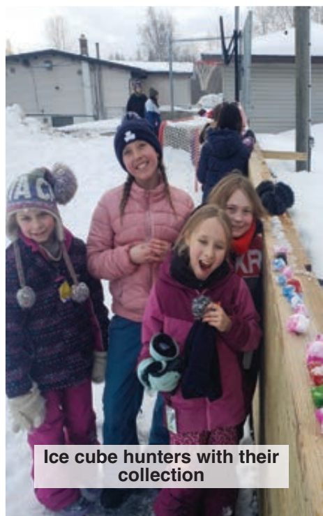
Ice cube hunters with their collection