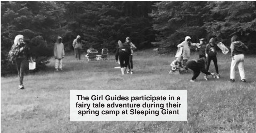
The Girl Guides participate in a fairy tale adventure during their spring camp at Sleeping Giant