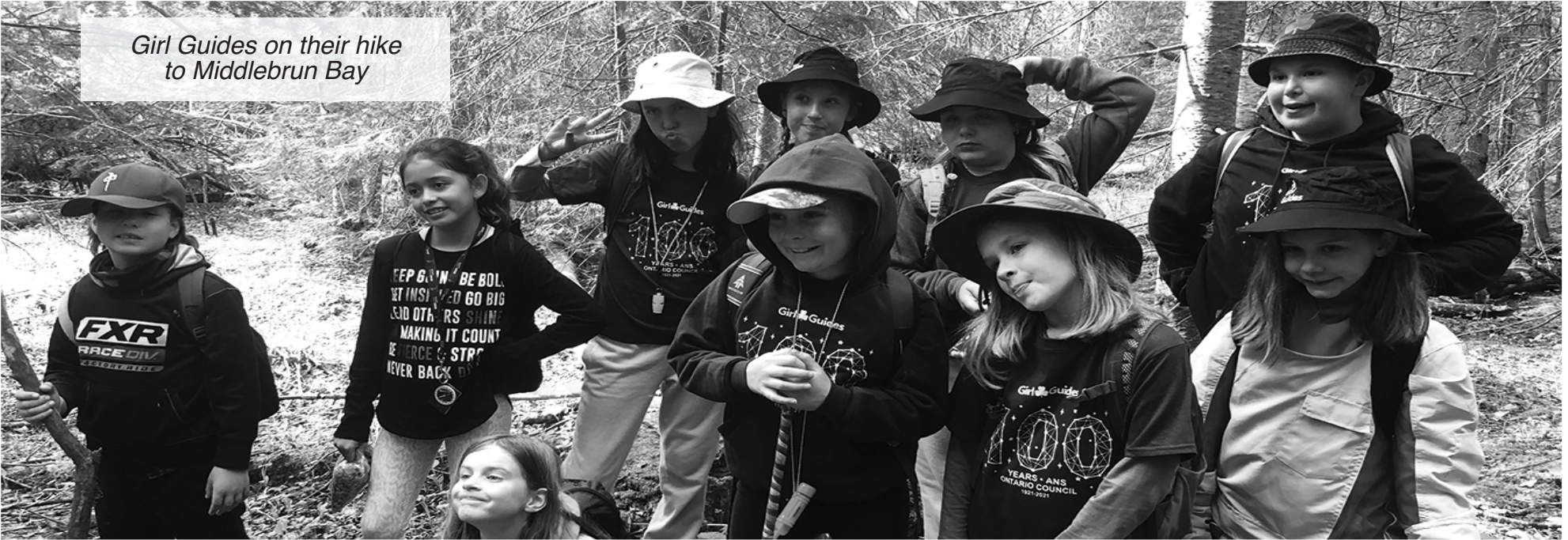
Girl Guides on their hike to Middlebrun Bay