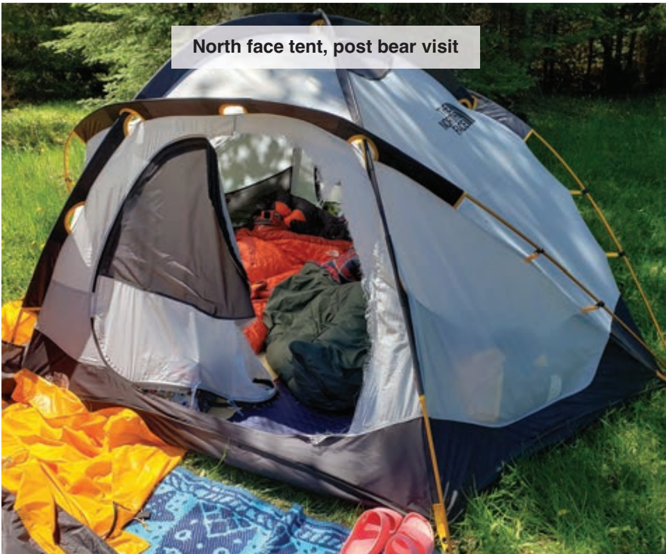
North face tent, post bear visit