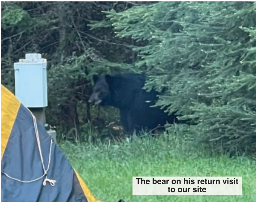
The bear on his return visit to our site