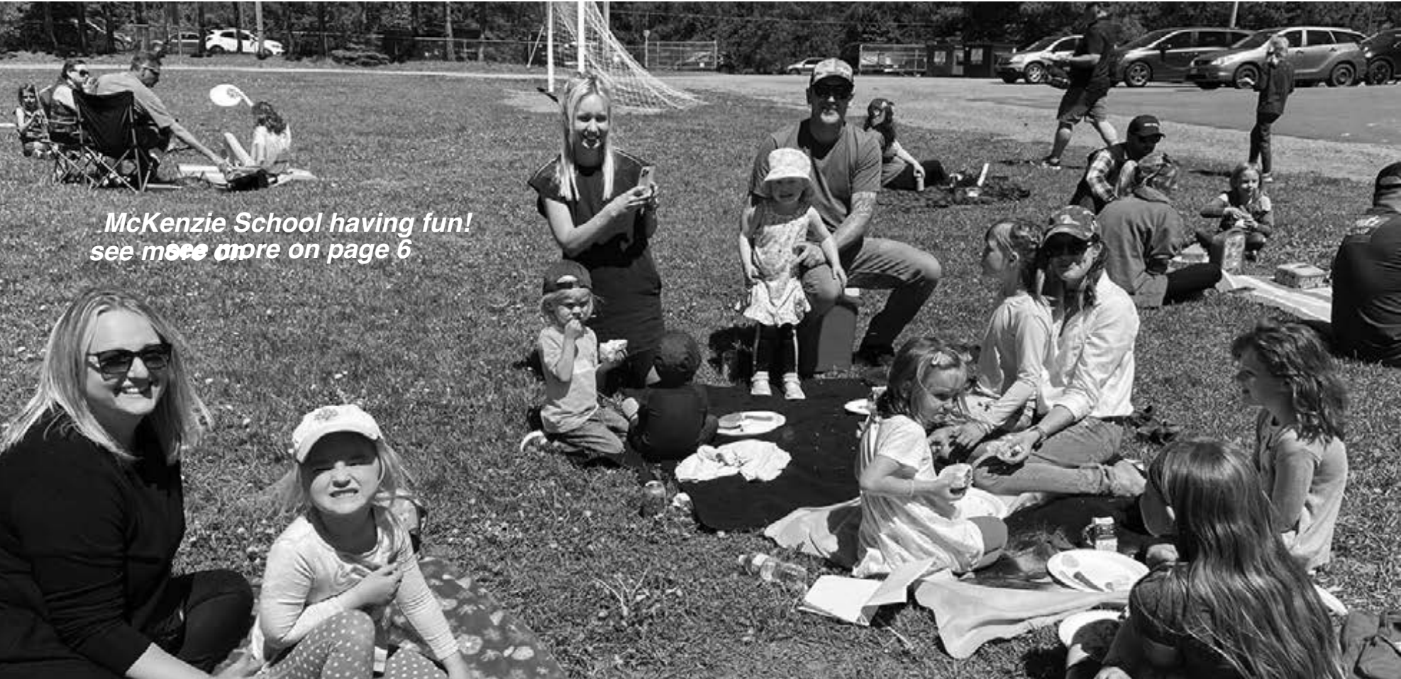
McKenzie School having fun! see more on page 6