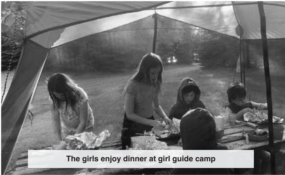
The girls enjoy dinner at girl guide camp