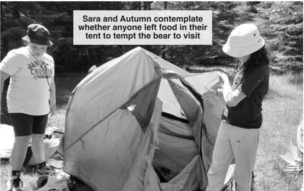
Sara and Autumn contemplate whether anyone left food in their tent to tempt the bear to visit