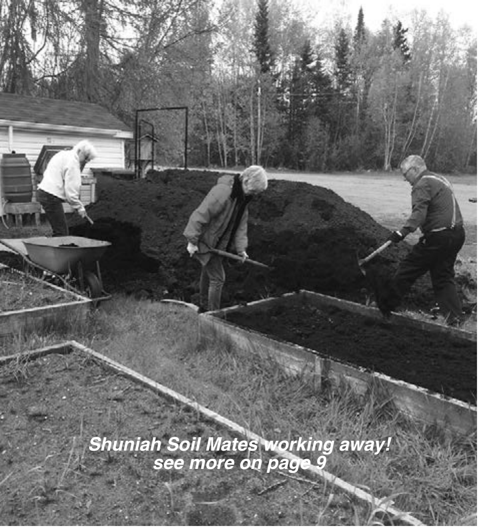
Shuniah Soil Mates working away! see more on page 9