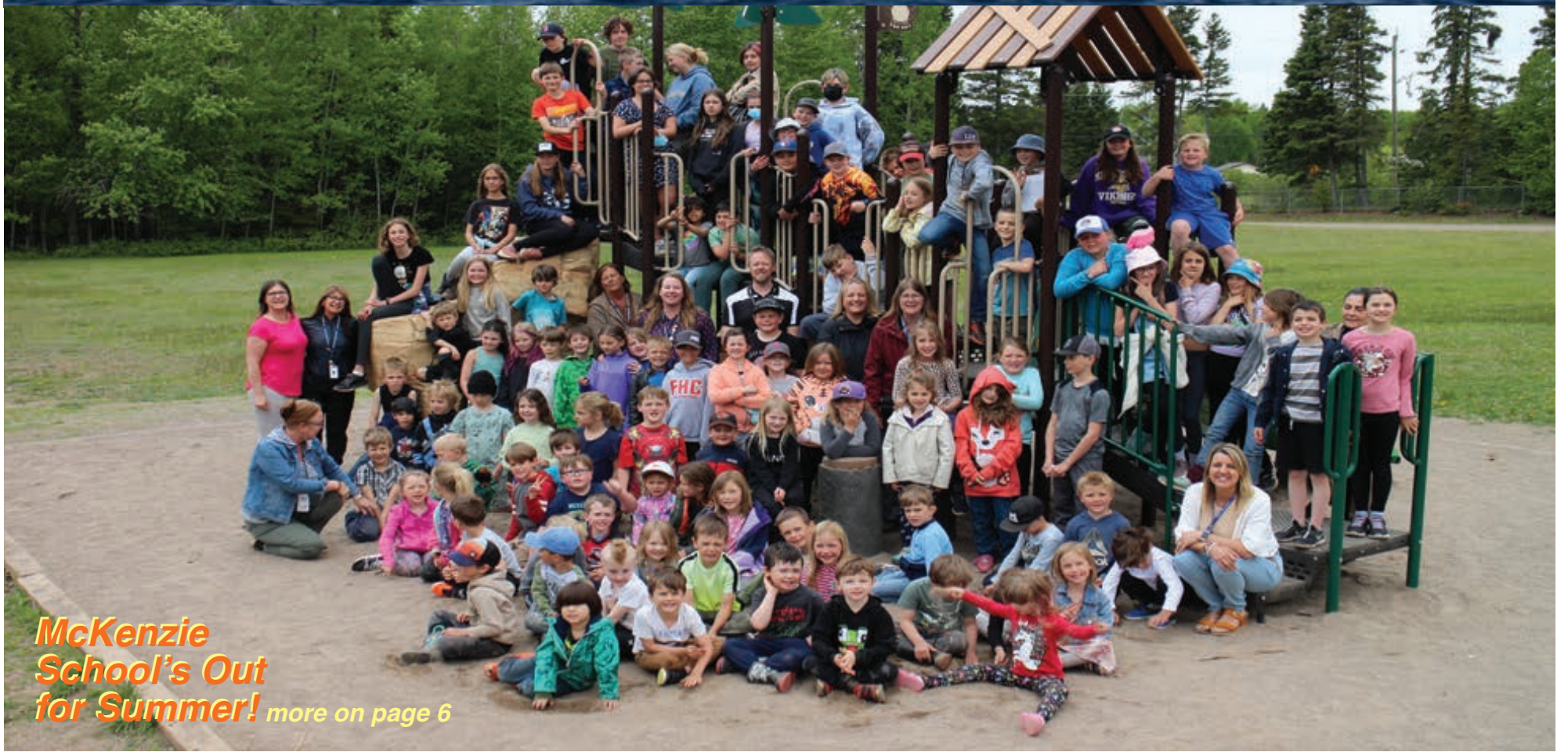
McKenzie School's Out for Summer! more on page 6