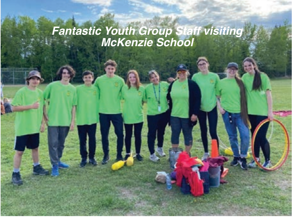
Fantastic Youth Group Staff visiting McKenzie School