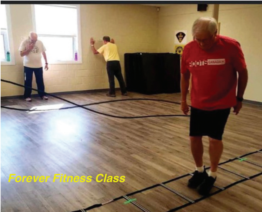
Forever Fitness Class