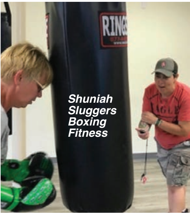
Shuniah Sluggers Boxing Fitness