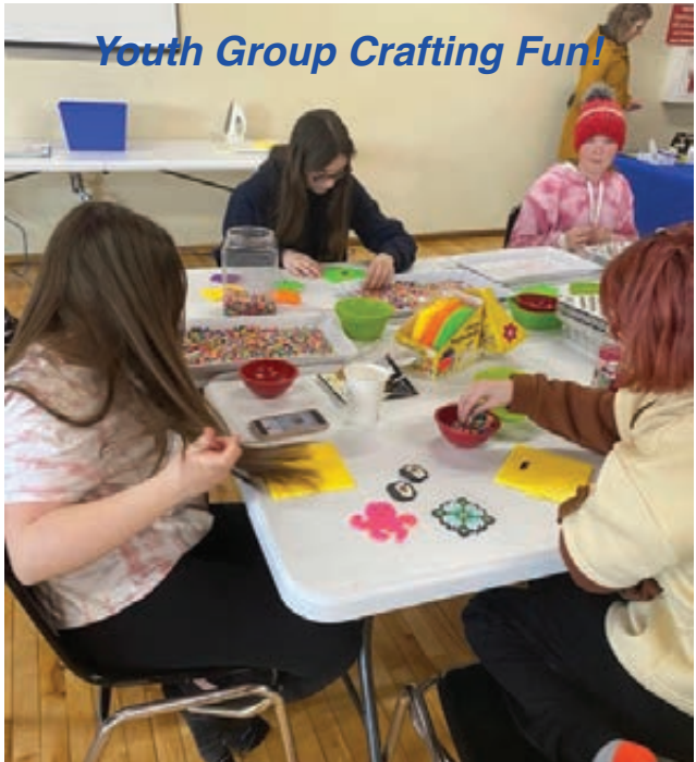
Youth Group Crafting Fun!