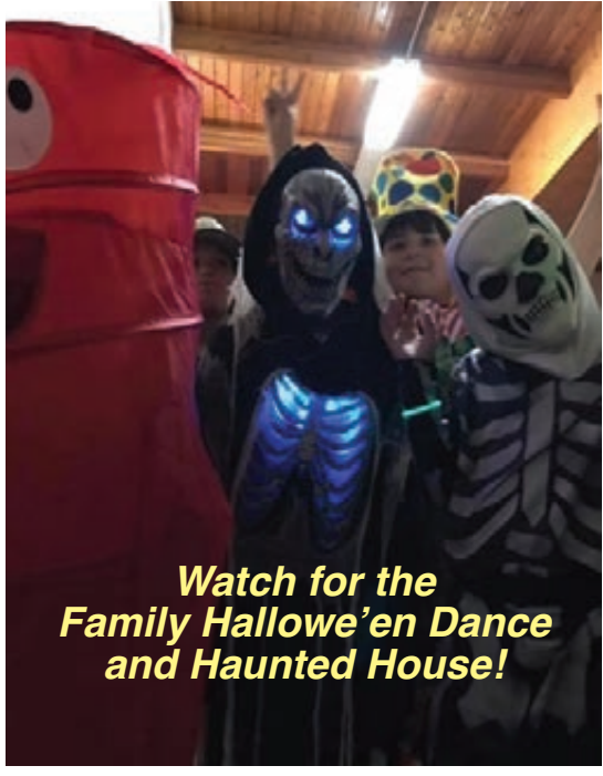
Watch for the Family Hallowe'en Dance and Haunted House!