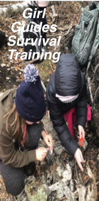
Girl Guides Survival Training