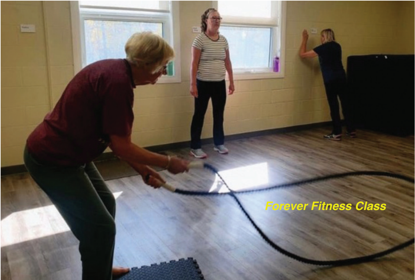
Forever Fitness Class