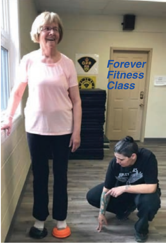
Forever Fitness Class