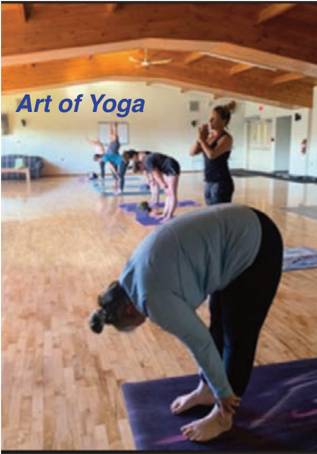
Art of Yoga