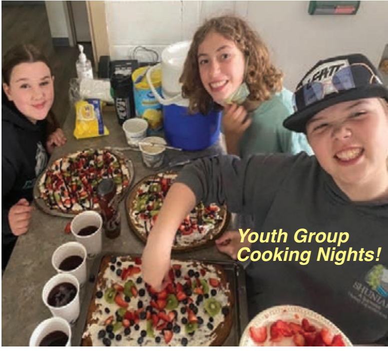
Youth Group Cooking Nights!