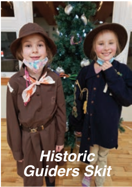
Historic Guiders Skit