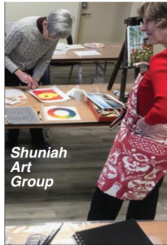
Shuniah Art Group