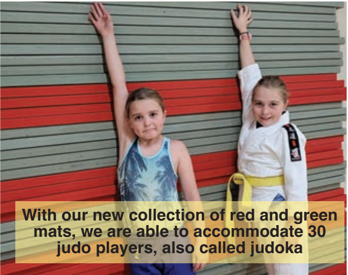
With our new collection of red and green mats, we are able to accommodate 30 judo players, also called judoka