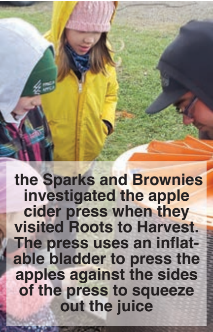
the Sparks and Brownies investigated the apple cider press when they visited Roots to Harvest. The press uses an inflatable bladder to press the apples against the sides of the press to squeeze out the juice