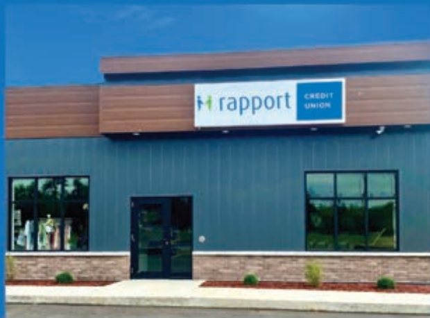
Our new location is under construction at 4785 Highway 11/17 - Unit C.

We're working hard to build an even better Rapport.