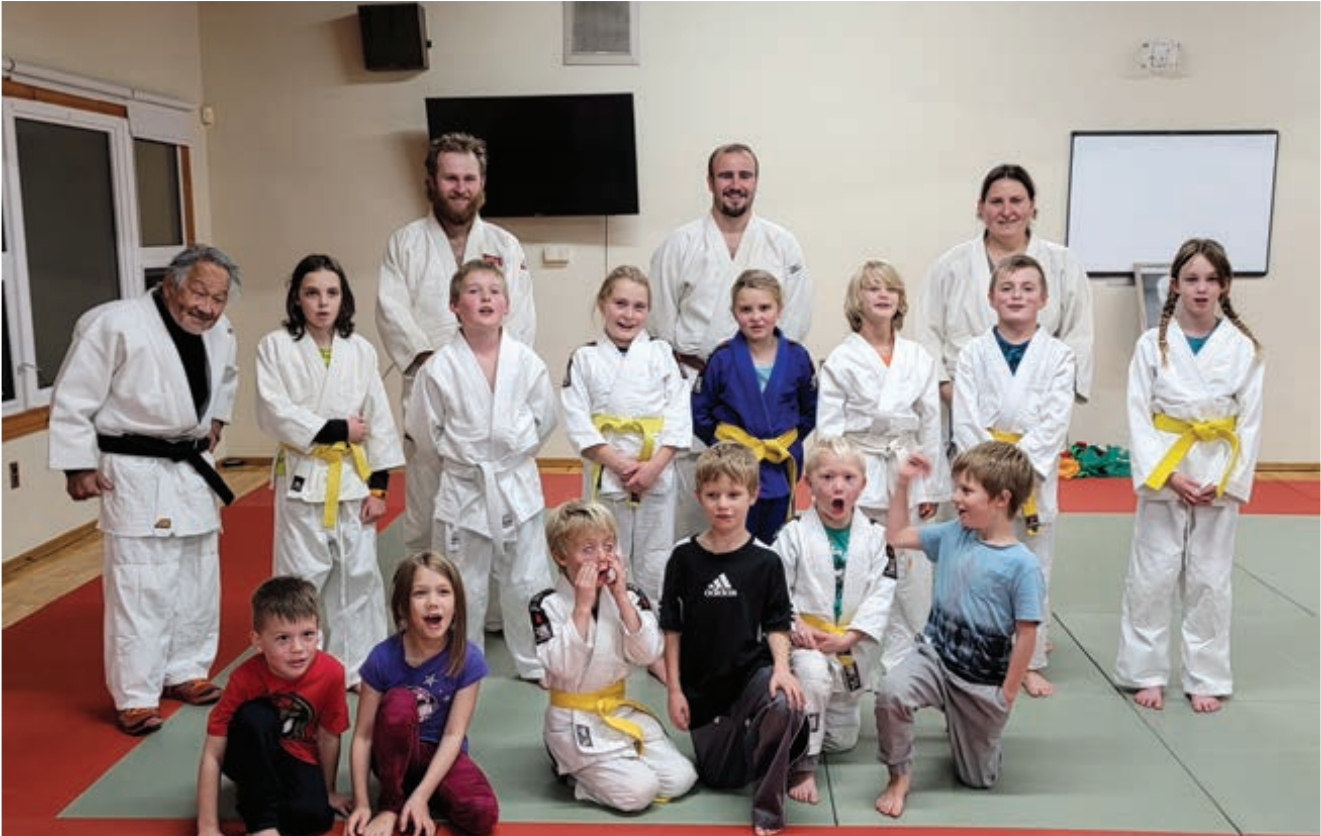
We're having tons of fun in Sakamoto judo! Lots of kids and adults are coming to try it out and the club is building. We look forward to showing off our skills at an open house soon!