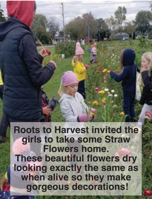
Roots to Harvest invited the girls to take some Straw Flowers home. These beautiful flowers dry looking exactly the same as when alive so they make gorgeous decorations!