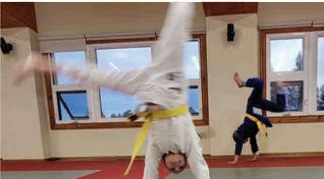
Cartwheels, breakfalls and push ups are all important training for judo