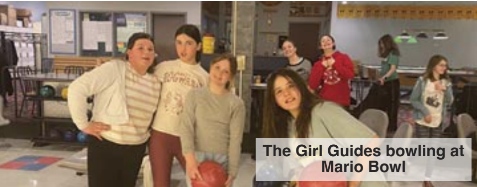
The Girl Guides bowling at Mario Bowl