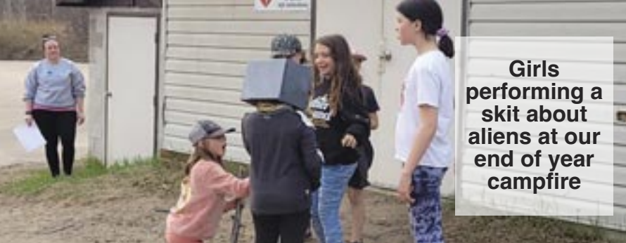
Girls performing a skit about aliens at our end of year campfire