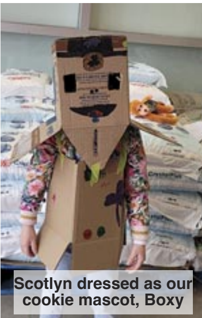
Scotlyn dressed as our cookie mascot, Boxy