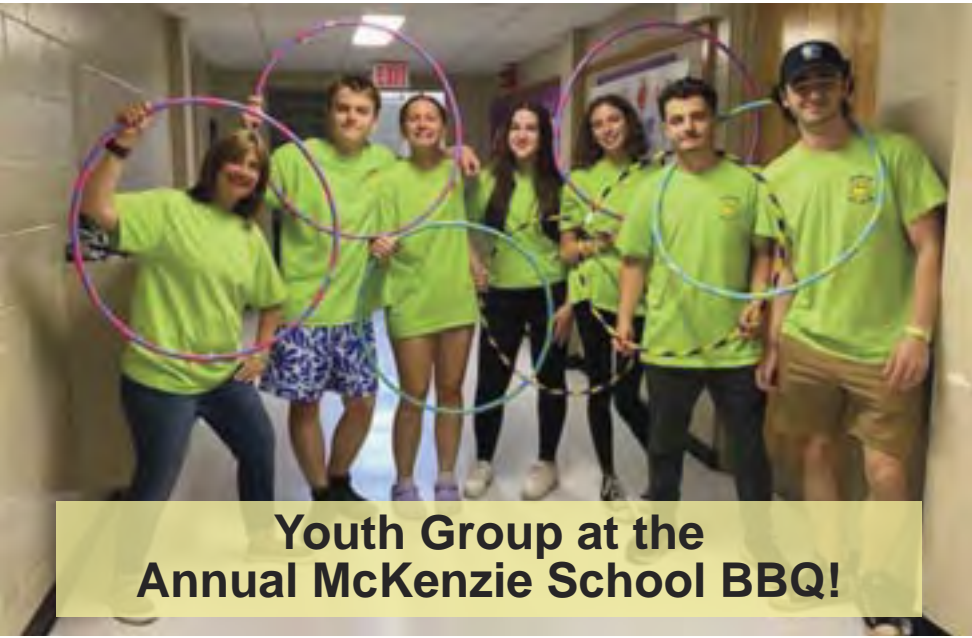
Youth Group at the Annual McKenzie School BBQ!