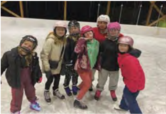
Thinking of cooler times in the summer heat!