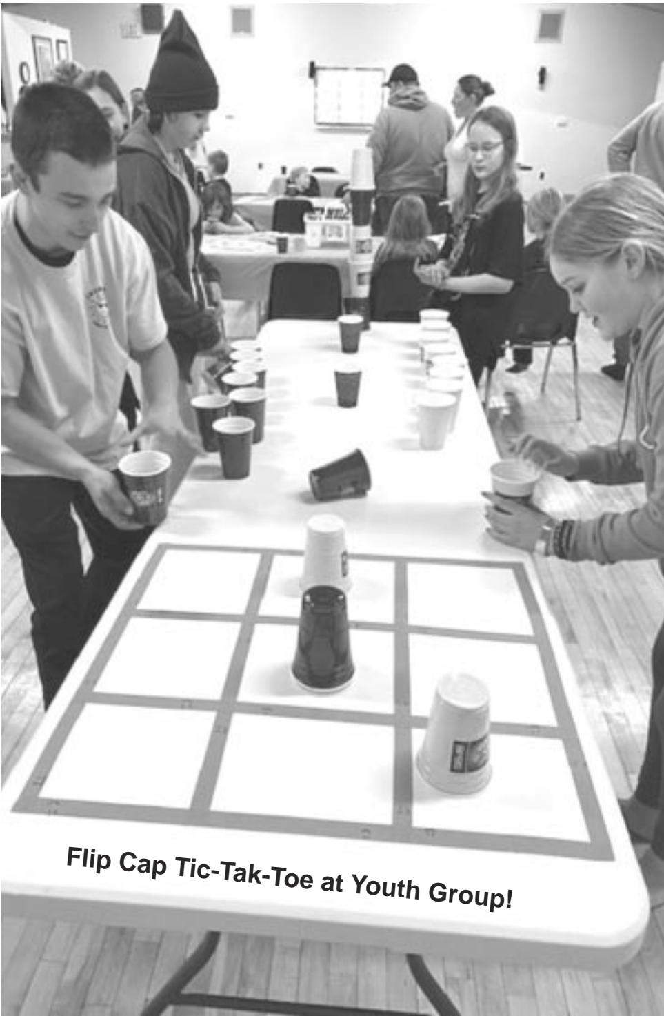
Flip Cap Tic-Tak-Toe at Youth Group!